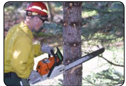
S-212 student demonstrating the proper method for face cutting.

This course gives the student practical knowledge and application skills of portable pump operations. Field exercises train students in the setup and operation of a portable pump along with foam applications.