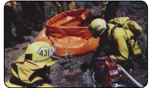
S-211 Students learning how to draft with a Mark 3 pump.

This course provides students with the knowledge and skills they need to serve as Type 3 Information Officers (IOF3). It touches on all aspects of establishing and maintaining an incident information operation, communicating with internal and external audiences, to handling special situations.