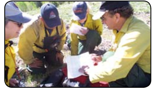
Maps & Compass field exercise.

This is not an NWCC course. This course is intended for potential and qualified Type III Incident Commanders. The course will cover the information needed for effective management of a Type III Incidents; organizational skills; agreements with local, state and federal agencies; incident business requirements; and informational transfer and transitioning with Type I and Type II teams. Prerequisite: Division supervisor, company officer qualified, agency administrator or county emergency personnel.