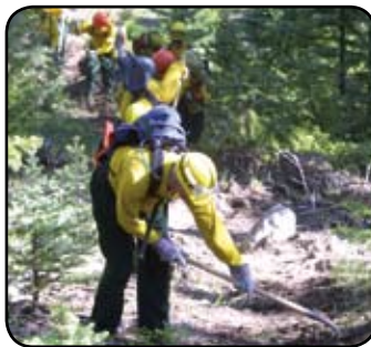
S-130/190 students building fireline during field exercises.

This training course is designed as a self-assessment opportunity for individuals preparing to step into a leadership role. The course combines one day of classroom instruction followed by a second day in the field with students working through a series of problem solving events in small teams (Field Leadership Assessment Course). Topics areas include: Leadership values and principles; transition challenges for new leaders; situational leadership; team cohesion factors; and ethical decision-making. Prerequisites: L-180 & experience on incident assignments in operations or support functions.